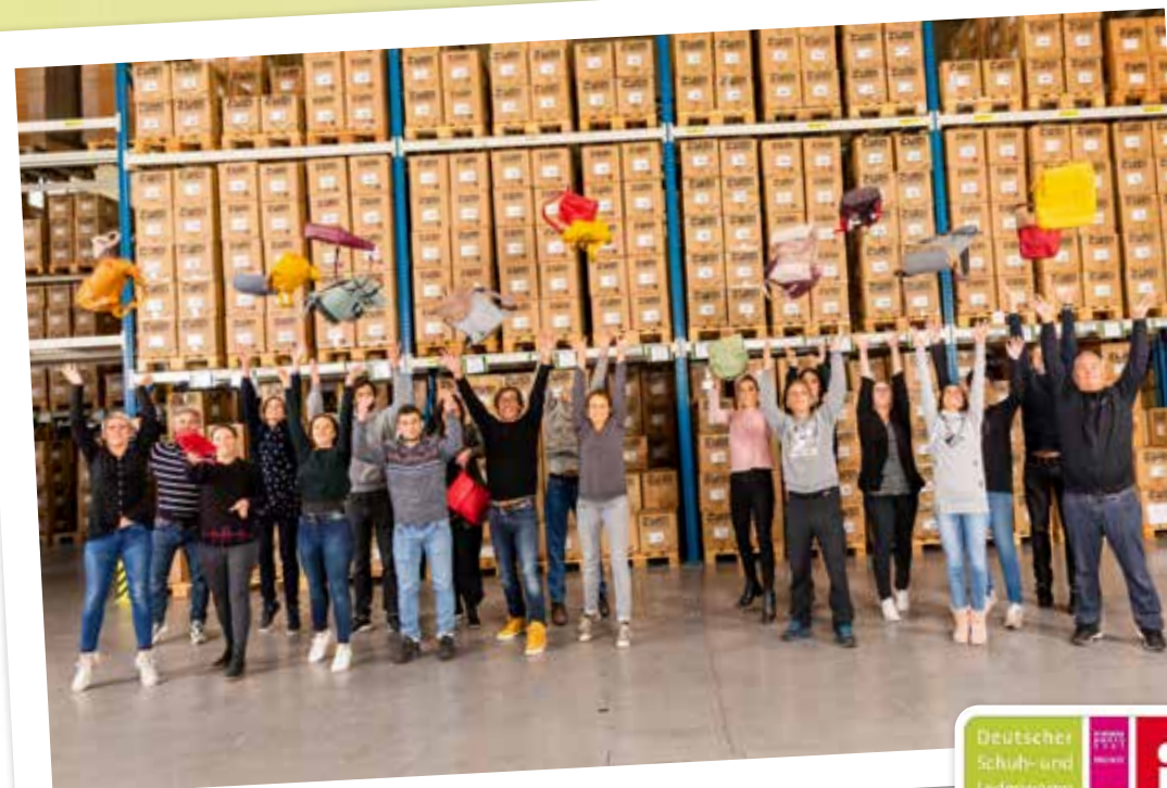
ILLUSTRATION: GILBERTO ACOSTA