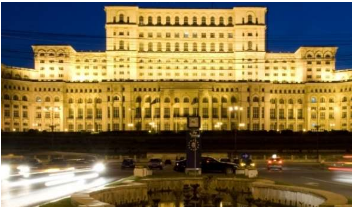
Palace of Parliament - Venue for the 8th Annual Forum

More information on the venue, the services it provides and his cultural program can be found at http://cic.cdep.ro/en .